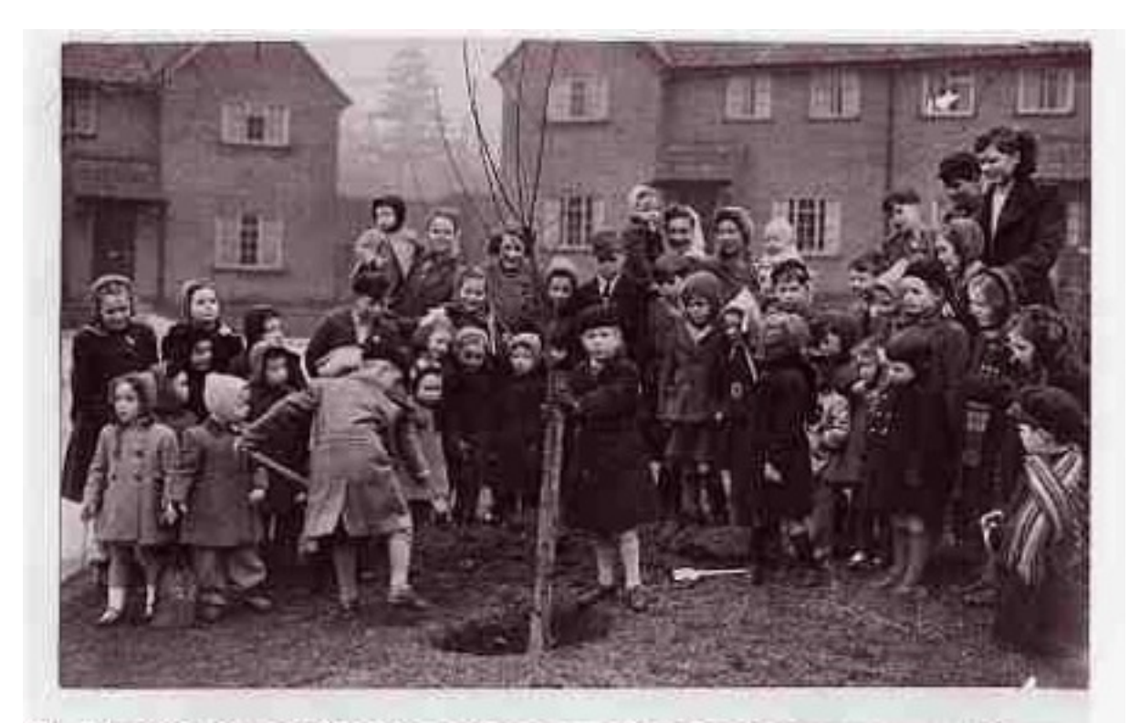
PLANTING OF A TREE TO CELEBRATE THE CORONATION OF QUEEN ELIZABETH II ON HILTON CLOSE BROMPTON

Elizabeth is featured on the picture of the Tree Planting Hilton Close - 1953 Coronation of Queen Elizabeth. Elizabeth is standing- the second "big girl" from the left.