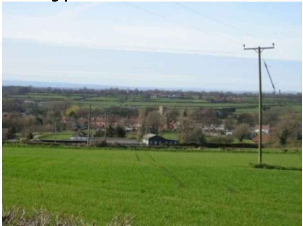
Looking north over Brompton from Bullamoor Lane

The Farming industry has for many years been an important part of Brompton's History and daily life. Unlike the Linen Industry which went into decline and is no longer, farming continues to thrive and is a major part of life in Brompton today.