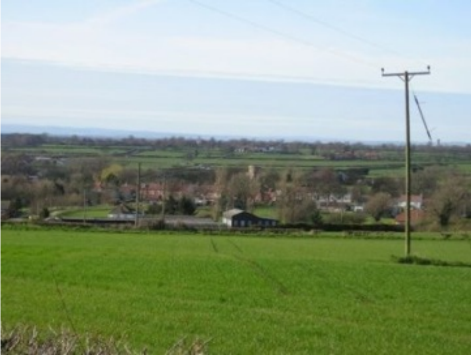
Looking north over Brompton from Bullamoor Lane

The Farming industry has for many years been an important part of Brompton's History and daily life. Unlike the Linen Industry which went into decline and is no longer, farming continues to thrive and is a major part of life in Brompton today.