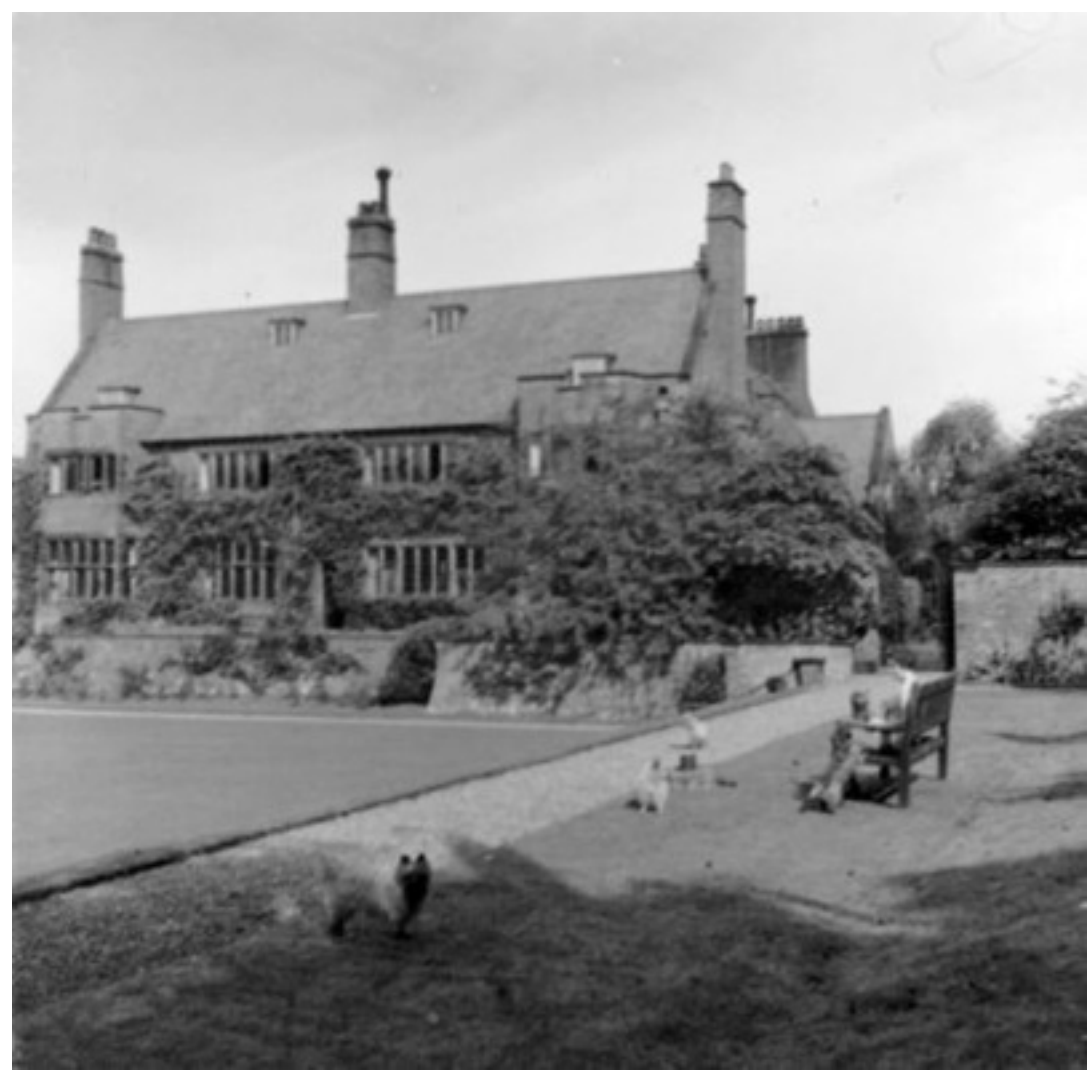
This view from the pavilion shows the family relaxing with their pets.