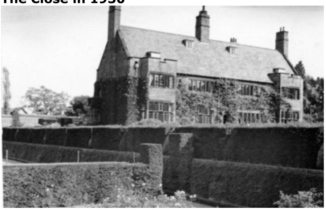
This view is from the Rose Garden taken in 1930.